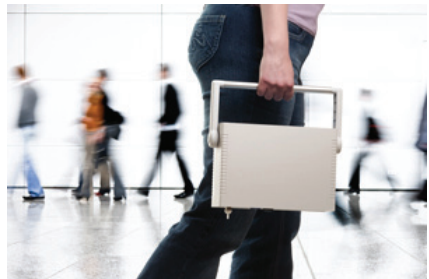
YES Plus LGA (picture above) is housed in a rugged ABS enclosure with swivel handle to act as a stand support or for carrying the instrument.