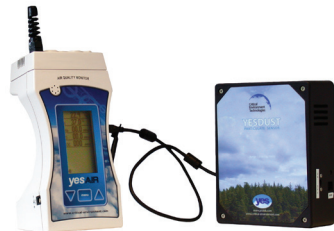
YESAIR is attached to a remote particulate sensor, YESDUST (picture above).